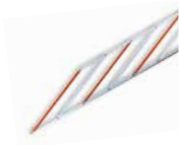
ASOGRID Aluminium rack (2 m)