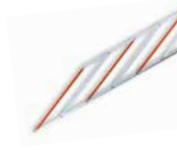
ASOGRID Aluminium rack (2 m)