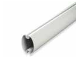
ASO 5000 Bar 5 m