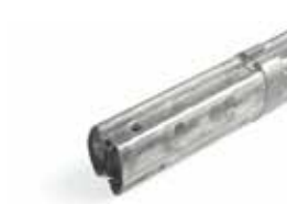
ASOLINK Expansion joint compatible with ASO 3000