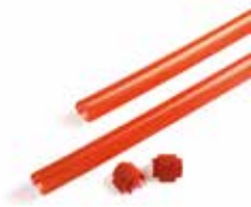
ASORUB Rubber impact protection strip