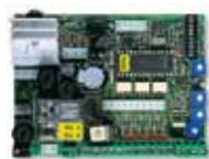
STAR Open Spare control unit