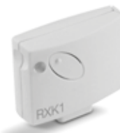
RX K1 Plug-in receiver