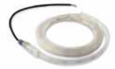
ASOLED6000 Indicator lights for click fixture on upper or lower side of bar. Length 6 m