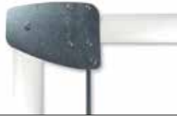
ASOJOINT Joint for bars ASO3000 (from 1950 mm to 2400 mm)