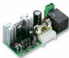
Bat K30 Plug-in card for battery charger