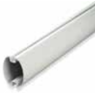
ASO 3000 Bar 3 m