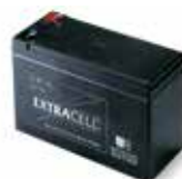
BAT60 12 V, 6 Ah batteries (two batteries required for operation)