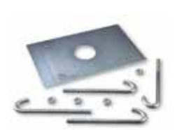
ASOB6000 Anchorage base