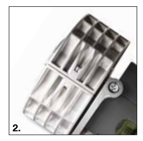
LIMIT SWITCHES Built-in electrical limit switches FAST INSTALLATION Direct installation on shaft