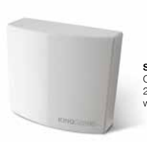
STAR B PLUS Control unit for one 230 Vac motor with built-in receiver