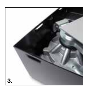
RELEASE Available with key or lever FOUNDATION BOX